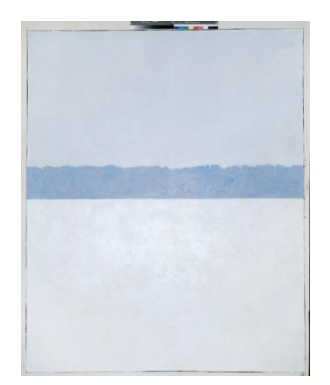
Minimalist, Snow Buntings 2002, Oil on Canvas, 110x88