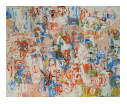
Abstract, Pick Pocket, 2013, Oil, Graphite on Canvas, 84x104