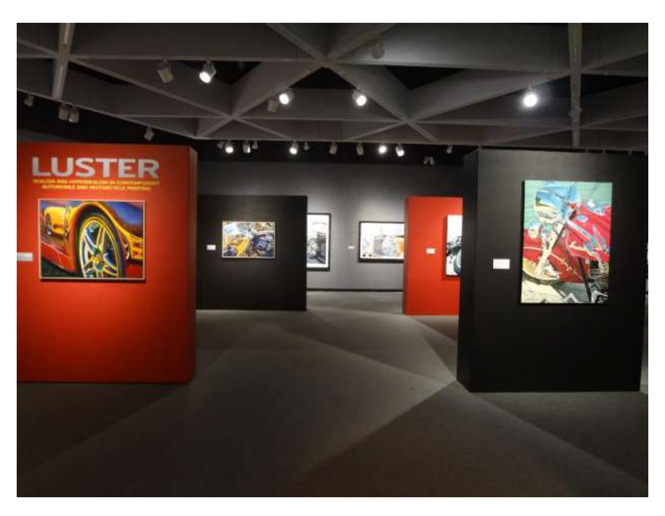
LUSTER World Premiere Museum of Arts and Sciences Daytona, Florida