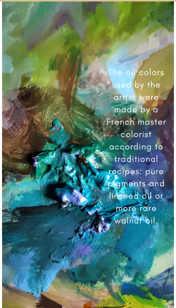
The oil colors used by the artist were made by a French master colorist according to traditional recipes: pure pigments and linseed oil or more rare walnut oil.