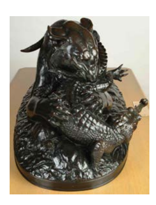
Tiger Devouring a Gavial Antoine-Louis Barye