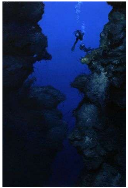
To The Wall, Jean-Louis Courteau 2008, Oil, 36x24

ART OF THE DIVE / PORTRAITS OF THE DEEP is an exhibition that features work by leading artists worldwide who portray underwater life forms and habitat. Subjects range from sailfish, marlin, and other billed game fish; to striped bass, bluefish, tarpon, bonefish, snook, tuna, dolphin, sharks, and whales, as well as sea turtles, rays, and the countless array of other life ranging from corals to crustaceans, mammals, mollusks, and plants, that inhabit the salt-water world as well freshwater. ART OF THE DIVE/PORTRAITS OF THE DEEP features original paintings and sculptures and photographs of outdoor murals by the world's leading sculptors and dive painters, beginning with New York painter, Stanley Meltzoff (1917-2006), who, as curator/author Dr. David J. Wagner explains in AMERICAN WILDLIFE ART, was given his art-ofthe-dive start with a commission from National Geographic Society in the 1960's and who is now generally recognized as the progenitor of the genre. As such, Meltzoff has been the model if not the inspiration for a circle of painters who subsequently specialized in portraits of the deep. Included from among these in ART OF THE DIVE are: Al Barnes (of Fulton, TX); M.J. Brush (Mystic, CT; who painted on the Northeast Underwater Research Technology and Education Center Alvin Submersible @ 1000 fathoms depth 500 nautical