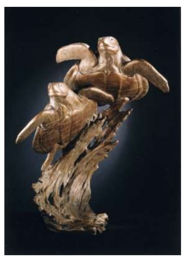
Journey's End, Kent Ullberg 1992, Bronze, 41x30x33