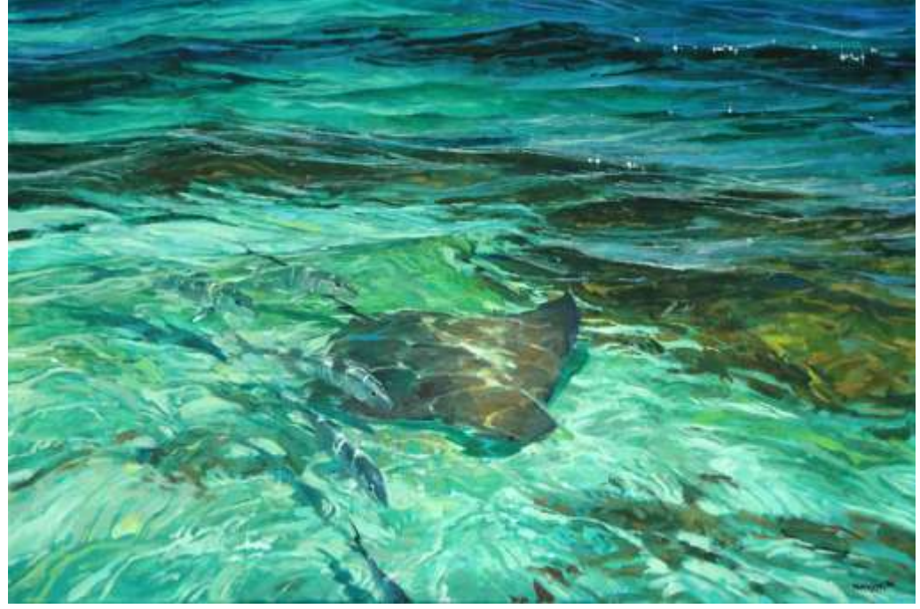
Meal Ticket, Al Barnes 2008, Oil, 30 x 40