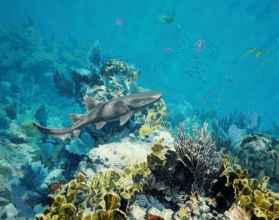
Pennekamp, Don Ray 2007, Oil, 32x38

CONTINUE BELOW FOR PHOTOGRAPHS OF SAMPLE ARTWORKS FROM ART OF THE DIVE