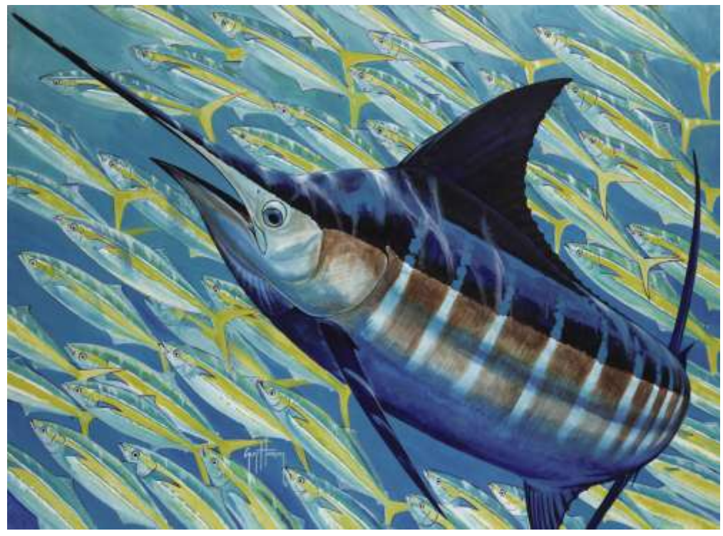
Blue Runner, Guy Harvey 2007, Acrylic, 39½ x 49½