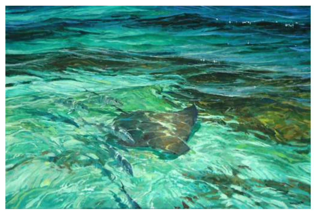
Meal Ticket, Al Barnes 2008, Oil, 30 x 40