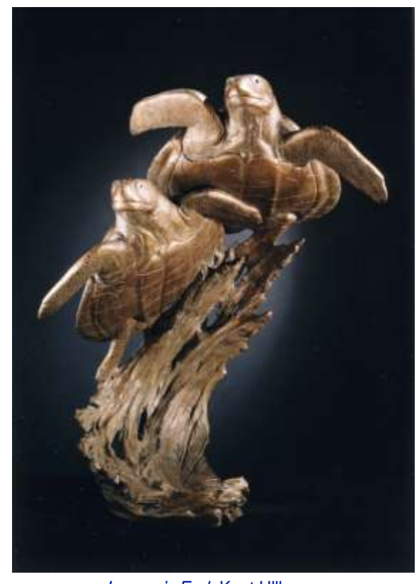
Journey's End, Kent Ullberg 1992, Bronze, 41x30x33