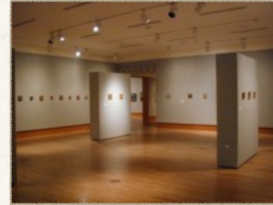
November 5 - December 31, 2011 Dennos Museum Center Traverse City, MI