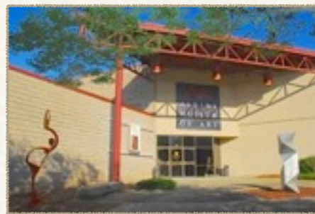
May 14 - August 15, 2015 Albany Museum of Art Albany, GA

Dates Subject to Change | Additional Venues Pending