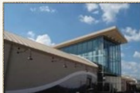
Back by popular demand! September 4 - October 30, 2015 Yadkin Cultural Arts Center