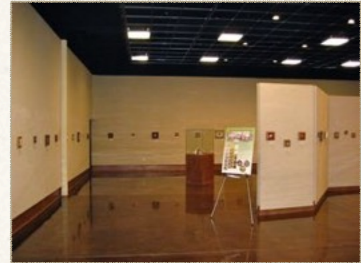
September 4 - November 28, 2010 Rolling Hills Wildlife Adventure Salina, KS