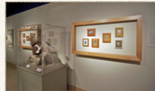
May 15 - October 13, 2012 Nevada State Museum Carson City, NV