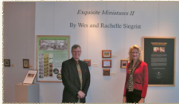
Back by popular demand! November 15 - December 21, 2012 Yadkin Cultural Arts Center Yadkinville, NC