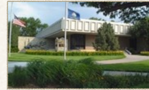
November 4 – December 4, 2016 Dane G. Hansen Memorial Museum Logan, KS