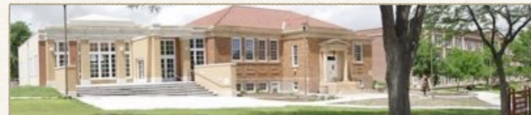
September 21 - December 21, 2017 Mari Sandoz High Plains Heritage Center Chadron, NE