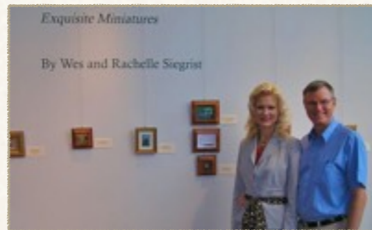
September 17 - October 16, 2011 Yadkin Cultural Arts Center Yadkinville, NC