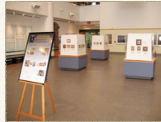
January 21 - March 21, 2012 San Diego Natural History Museum San Diego, CA