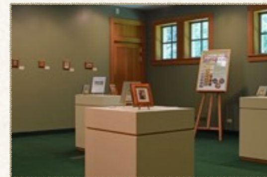
July 12, 2014 - November 7, 2014 Roger Tory Peterson Institute of Natural History Jamestown, NY