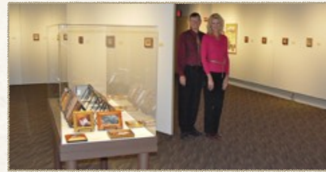
August 10, 2013 - January 5, 2014 Kenosha Public Museum Kenosha, WI