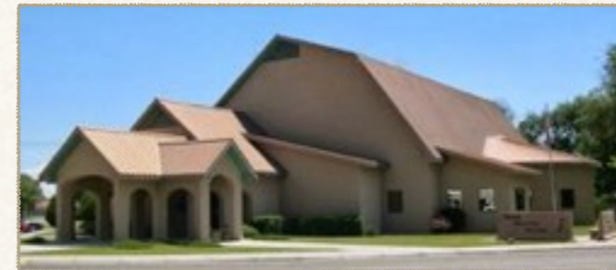
June 4 - September 3, 2017 Stauth Memorial Museum Montezuma, KS