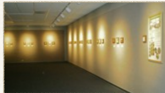
April 7 - June 2, 2013 Museum of the Gulf Coast Port Arthur, TX