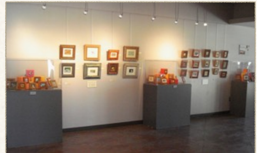
December 11, 2010 - March 13, 2011 Arizona-Sonora Desert Museum Tucson, AZ