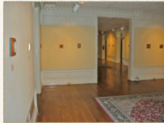
June 10 - August 28, 2011 Museum of the Southwest Midland, TX