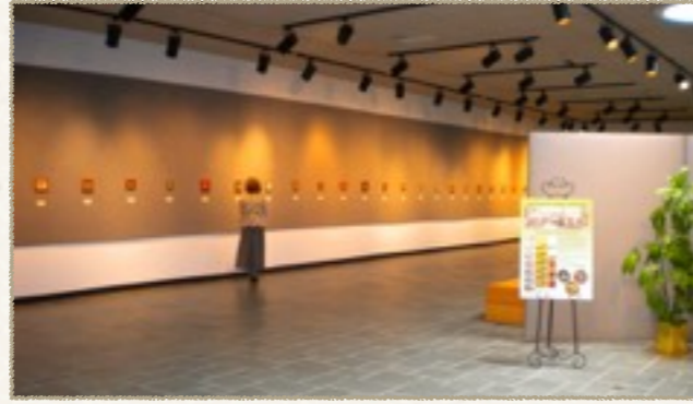
April 16 - May 15, 2011 Ella Carothers Dunnegan Gallery of Art Bolivar, MO