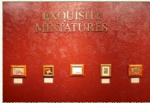
December 5, 2014 - April 15, 2015 Steamboat Art Museum Steamboat Springs, CO